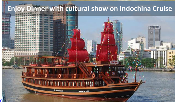
Enjoy Dinner with cultural show on Indochina Cruise