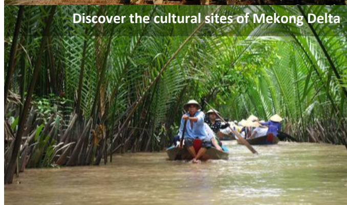
Discover the cultural sites of Mekong Delta