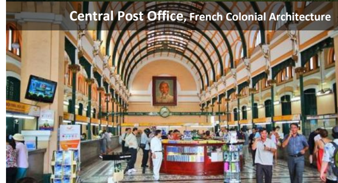
Central Post Office, French Colonial Architecture