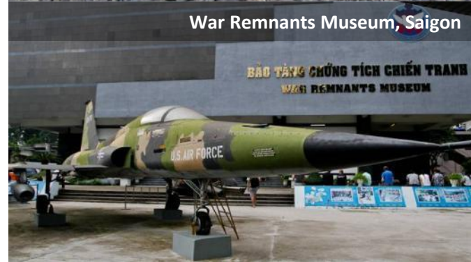
War Remnants Museum, Saigon