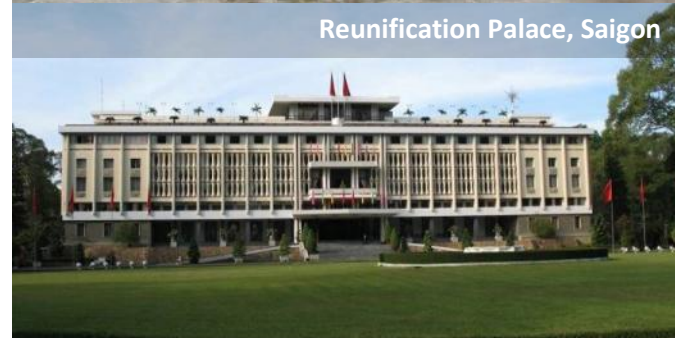
Reunification Palace, Saigon