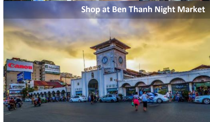
Shop at Ben Thanh Night Market