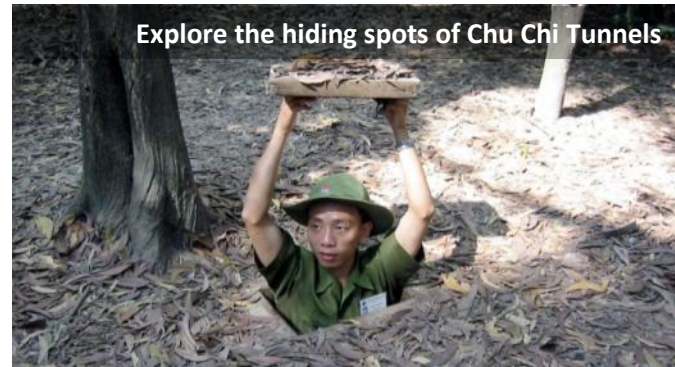
Explore the hiding spots of Chu Chi Tunnels