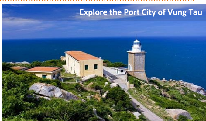
Explore the Port City of Vung Tau