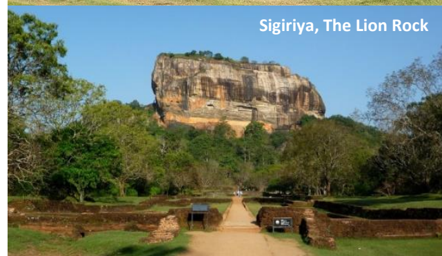
Sigiriya, The Lion Rock