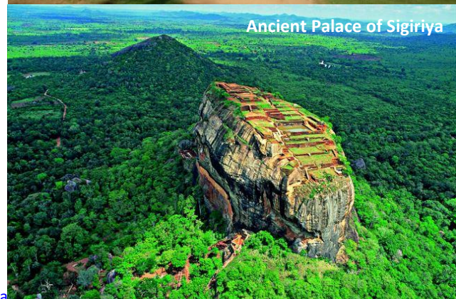
Ancient Palace of Sigiriya