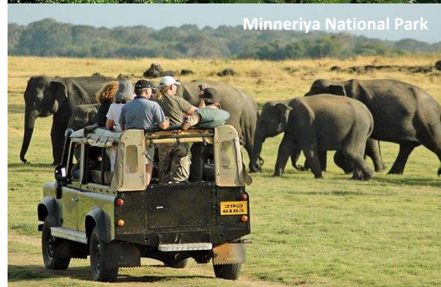
Minneriya National Park